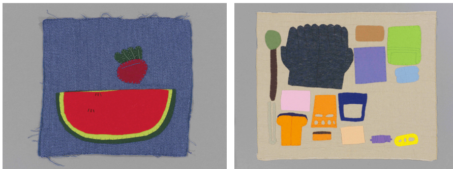
Junko Yamamoto, 1990, watermelon and tulip & 1990, Barbeque

Yuichi Saito (*1983, Saitama Prefecture) creates avant-garde calligraphs. With a swift stroke, he animates titles of his favourite TV shows, such as Pocket Monster , Doraemon , Stray Cops , and TV Champion in a unique way. His works are informed by his interest in the shows, executed on paper, and each produced on the very day it is broadcast. His abstract implementation of titles results in a truly idiosyncratic shape language.