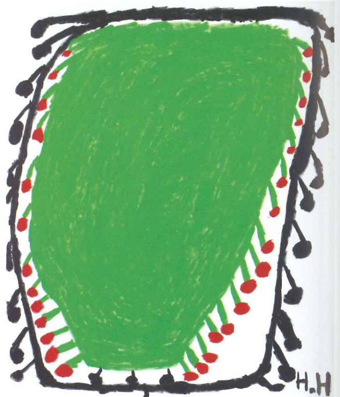
above: Helmut Hladisch, Umbrella , 201, pencil, 8.26 x 8.26 ins., 21 x 21 cm