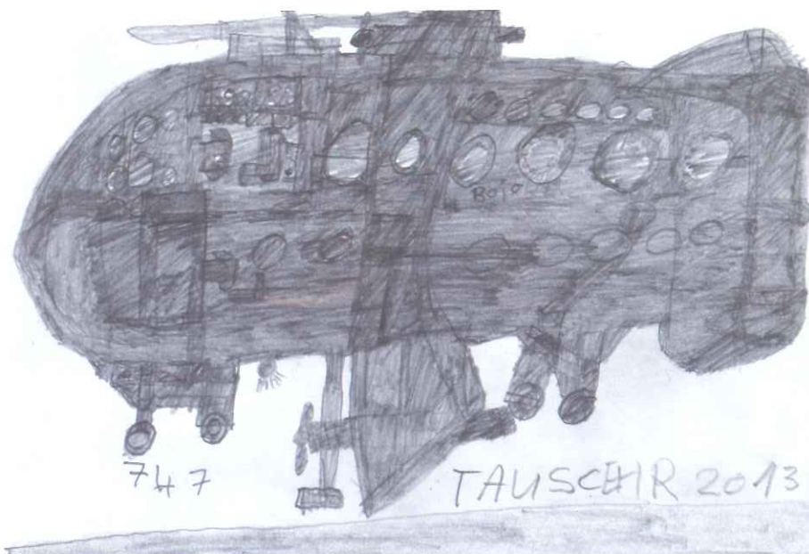
left: Jürgen Tauscher, 747 , 2013, pencil 5.9 x 8.26 ins., 15 x 21 cm

works by Helmut Hladisch and Jürgen Tauscher are shown in the exhibition small formats.! at the Museum Gugging until 7 September 2014