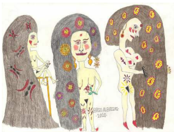
Girl with thick hair , Basel Al-Bazzaz (2020). Pencil, coloured pencils, 42 x 56 cm. Courtesy gallery gugging ; price: €2.000

The gallery gugging celebrates three drawers with Basel Al-Bazzaz, Helmut Hladisch & Jürgen Tauscher , who implement their drawing talent in completely different ways, and so in the exhibition Noah's Ark – three worlds open up that are as unique and wonderful as their creators themselves.