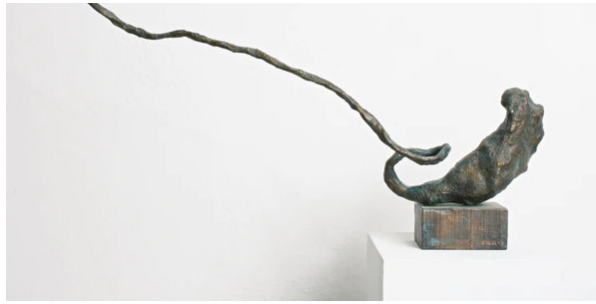
Untitled, Loys Egg, 2002. Cast bronze, patinated, 28 x 53 x 7 cm