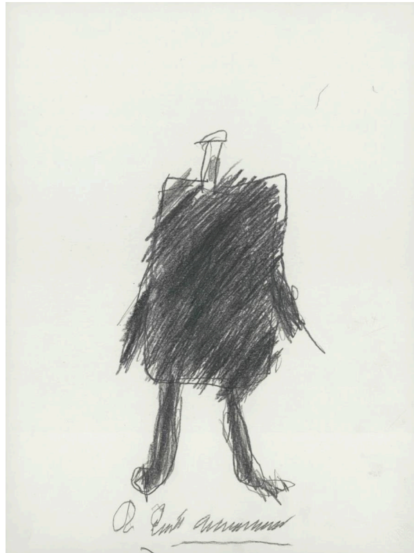
Human , Rudolf Limberger (Max), 1981. Pencil, 40.1 x 30.1 cm

Lively Lines , the title of the new exhibition at the Galerie Gugging Vienna , says it all, because everything revolves around the theme of energetic lines. In this new autumn exhibition, works by the versatile artist Loys Egg and the Gugging old master Oswald Tschirtner will meet in a very special way.