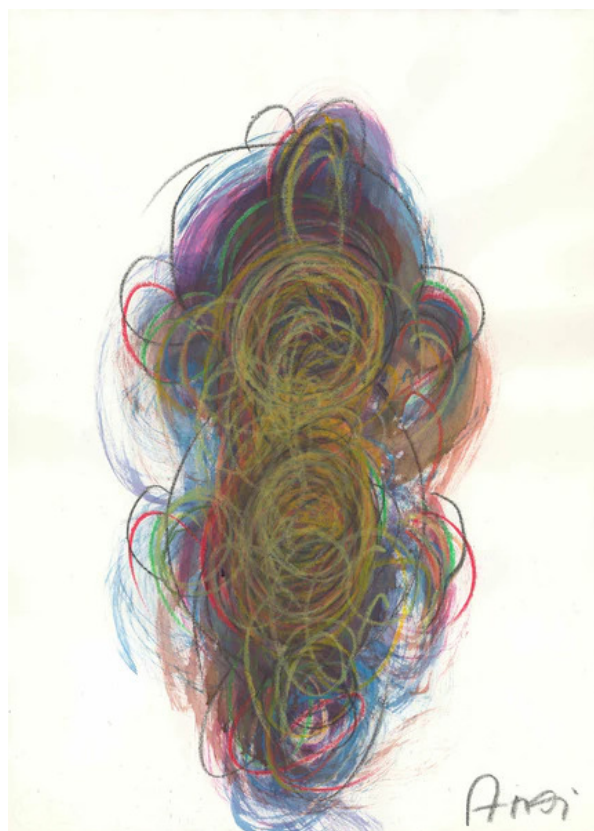
Figure , Arnold Schmidt, 2019. Watercolours, oil crayons, 74.7 x 55 cm