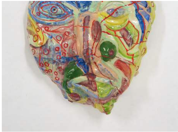
Cedric Johnson, Untitled, 2012. Ceramic mask, 14 x 16 x 5 in.

Recent Abstraction brings together new work by over 20 artists currently working in the studio at Creative Growth. This exhibition explores themes of abstraction across mediums, scale, and subject focus featuring recent paintings, drawings, sculptures, photography and ceramics. Bold mark making, strong colours and unique vision are typical of the work created by Creative Growth artists and Recent Abstraction is an opportunity to see how different artists approach Abstraction with their own unique style.