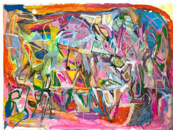
Joseph Alef, Untitled, 2018. Work on paper, 22 x 30 in.

Recent Abstraction brings together new work by over 20 artists currently working in the studio at Creative Growth. This exhibition explores themes of abstraction across mediums, scale, and subject focus featuring recent paintings, drawings, sculptures, photography and ceramics. Bold mark making, strong colours and unique vision are typical of the work created by Creative Growth artists and Recent Abstraction is an opportunity to see how different artists approach Abstraction with their own unique style.