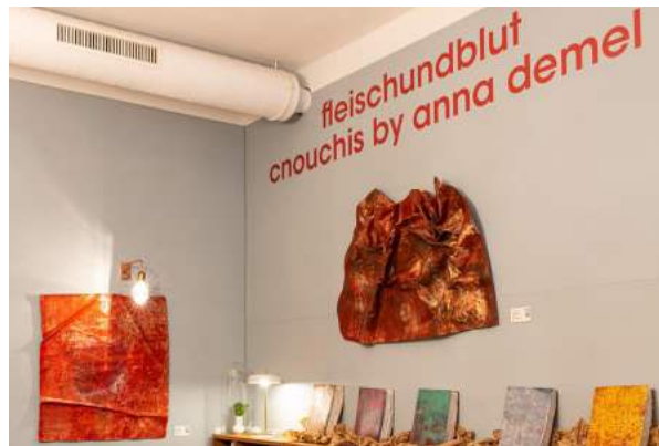
Installation shot at the Galerie Gugging Vienna.