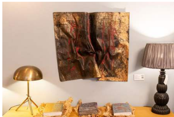
Installation shot at the Galerie Gugging Vienna.

Fleischundblut (flesh and blood) is the first exhibition of 2023 at the Galerie Gugging Vienna . Works by Anna Demel are presented for the first time – three-dimensional, sublime wall objects made of paperboard that appear like metal; 'Cnouchis', as the artist calls them.