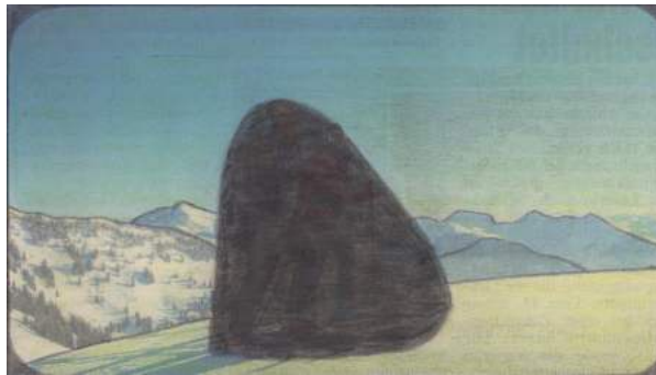
Leopold Strobl, Untitled, 2021. Pencil, coloured pencils on newsprint, mounted on paper, 3.3 x 5.75 in. / 8.3 x 14.6 cm

Galerie Gugging presented Leopold Strobl to the public for the first time in 2016 as part of the exhibition Locomotives Beneath a Green Sky . Strobl's work was since purchased by the MoMA in New York, and will now also be on display at this anniversary Venice Biennale.