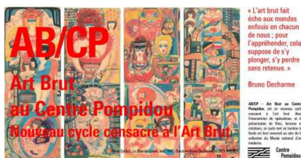
AB/CP poster, Centre Pompidou