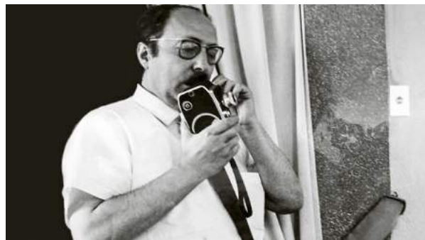
Francesc Tosquelles at MNCARS, Arquitectura Viva

Inspired by themes in the exhibition, this series will explore mental illness and therapeutic care practices rooted in community building, self-managed care, and creativity that echo Francesc Tosquelles's leadership at the Saint-Alban psychiatric hospital in Southern France during the mid-twentieth century.