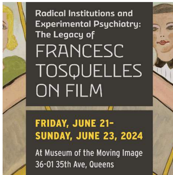
Francesc Tosquelles on Film poster, MoMI

This three-day long series will take place at MoMI with most screenings followed by in-person discussions with the filmmakers.