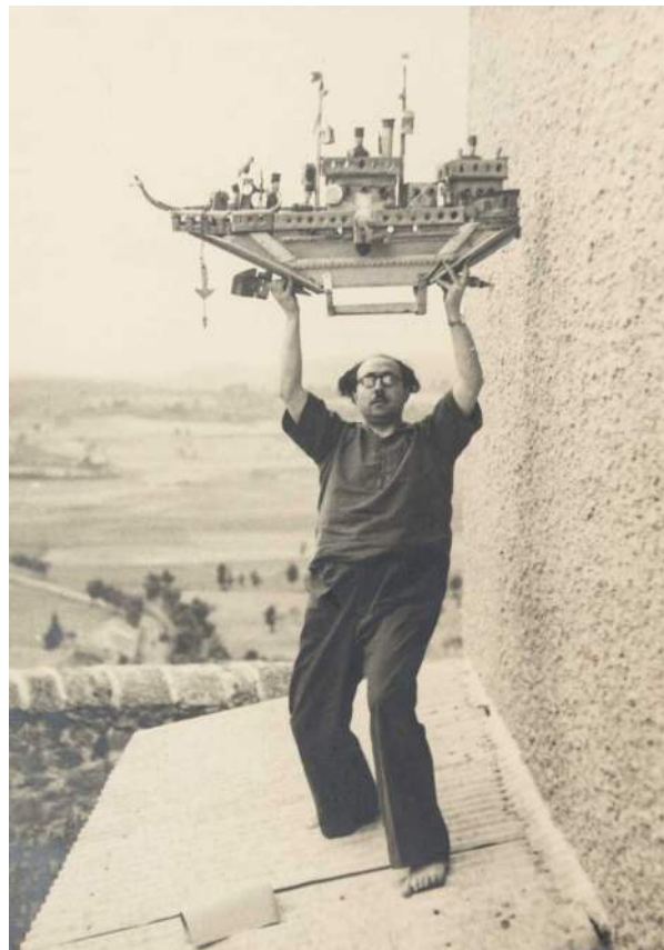
François Tosquelles in a children's park at Bonnafe Garden in Saint-Alban Hospital

The American Folk Art Museum is partnering with Museum of the Moving Image (MoMI) to present Radical Institutions and Experimental Psychiatry: The Legacy of Francesc Tosquelles on Film , co-organized in conjunction with the exhibition "Francesc Tosquelles: Avant-Garde Psychiatry and the Birth of Art Brut".