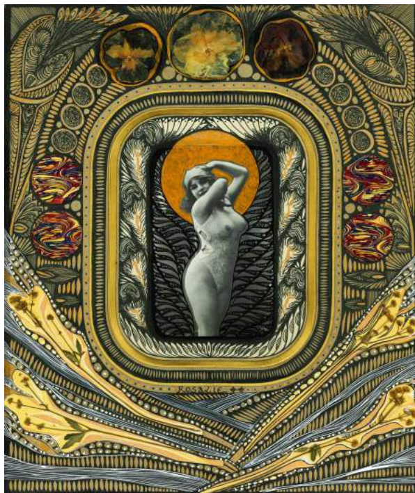
Margot, My ass is not my face , n.d., mixed media, 13.8 x 11.4 in. / 35 x 29 cm

For 30 years now, the Galerie Gugging has been exhibiting works by the Gugging Artists and, since 2009, also by their international artist colleagues, with the aim of making their work more visible in the context of contemporary art and promoting previously unknown artists.