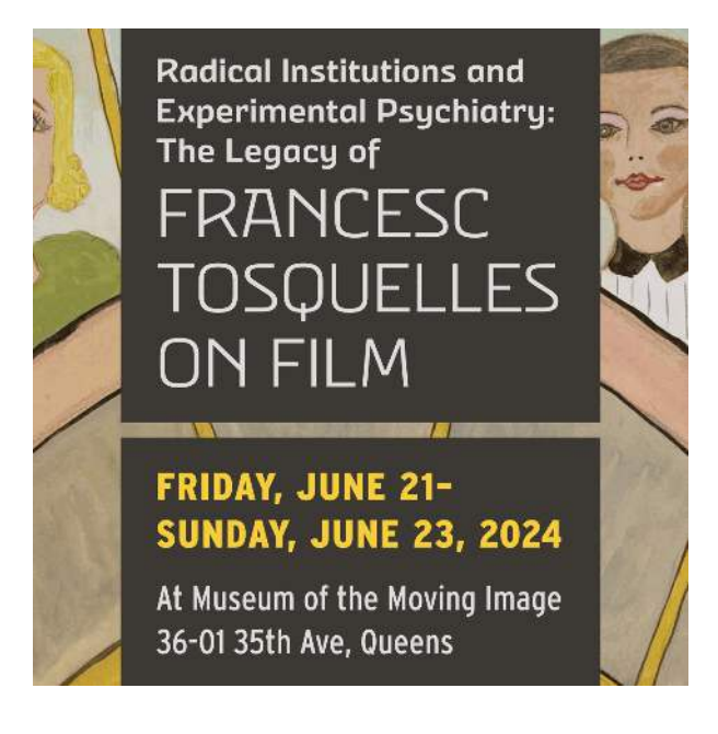
Francesc Tosquelles on Film poster, MoMI

This three-day long series will take place at MoMI with most screenings followed by inperson discussions with the filmmakers.