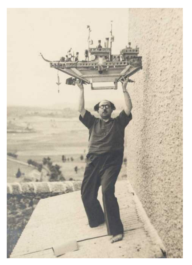
François Tosquelles in a children's park at Bonnafe Garden in Saint-Alban Hospital

The American Folk Art Museum is partnering with Museum of the Moving Image (MoMI) to present Radical Institutions and Experimental Psychiatry: The Legacy of Francesc Tosquelles on Film , coorganized in conjunction with the exhibition "Francesc Tosquelles: Avant-Garde Psychiatry and the Birth of Art Brut".