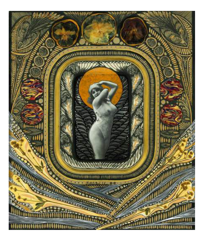
Margot, My ass is not my face , n.d., mixed media, 13.8 x 11.4 in. / 35 x 29 cm

For 30 years now, the Galerie Gugging has been exhibiting works by the Gugging Artists and, since 2009, also by their international artist colleagues, with the aim of making their work more visible in the context of contemporary art and promoting previously unknown artists.